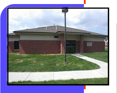
Scott Campus Commons Building / Business Office